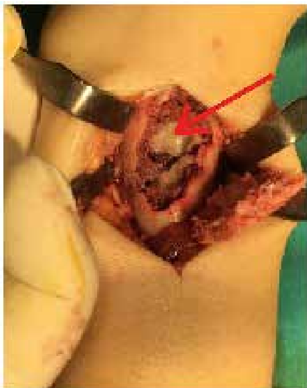
Figure 2. Intraoperative image of a distal radius localized giant cell tumor (red arrow showing tumoral lesion)