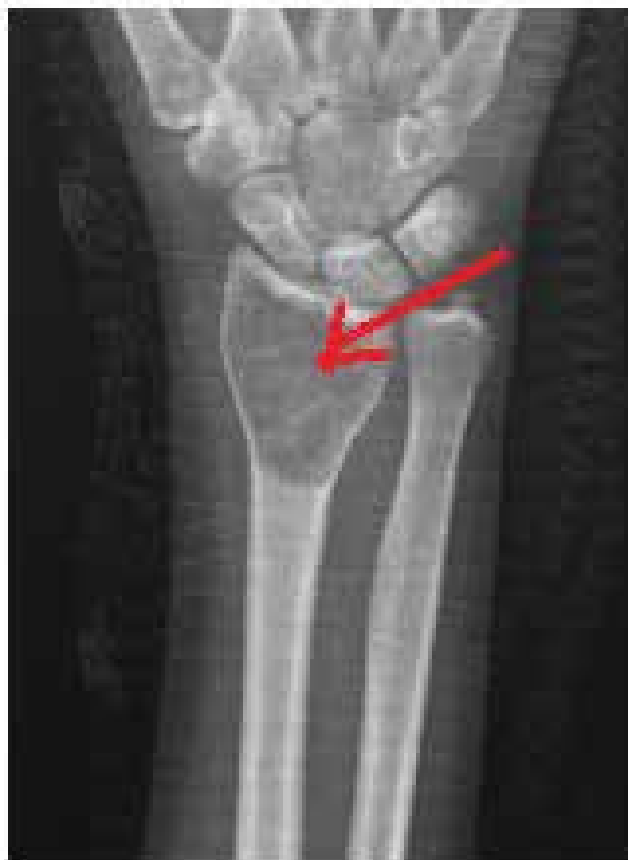
Figure 1. Radiograph of one of the patients with a distal localized giant cell tumor (red arrow showing the tumoral lesion)

iliac graft and radiocarpal arthrodesis were performed to a patient who was Grade 3 and had undergone en bloc resection and allograft fibula + iliac autograft due to nonunion complication (Table 2).