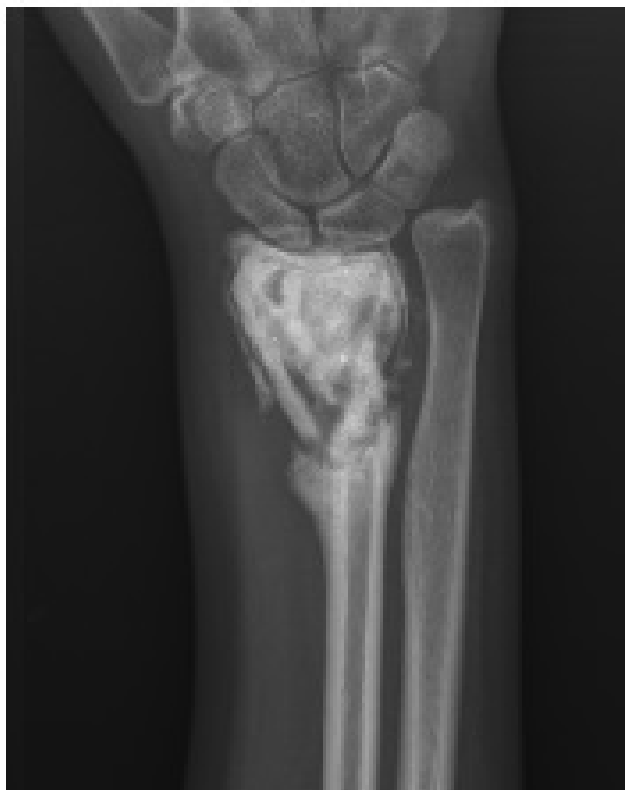
Figure 3. Post-operative 8-months recurrence image after curettage + cementation