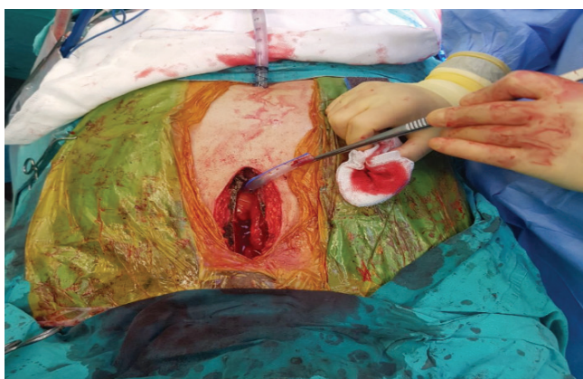
Figure 1. Post operative Aortic valve surgery

Eighteen patients underwent cardiac surgery by minimally invasive approaches in Hisar Intercontinental hospital between 2016 and 2017. The mean age of the patients was 53 (18–84) years, and four of them were females [22%]. J-mini-sternotomy was performed in four patients requiring aortic valve replacement (AVR) and in six patients CABG X1 with beating-heart (Figure-1). T-sternotomy was performed in two CABG X2 (LAD-RCA and LAD-D1) procedures, in four patients requiring mitral valve replacement (MVR) and in two patients requiring ASD repair with right anterolateral mini-thoracotomy incision (Figure 2, Figure 3).