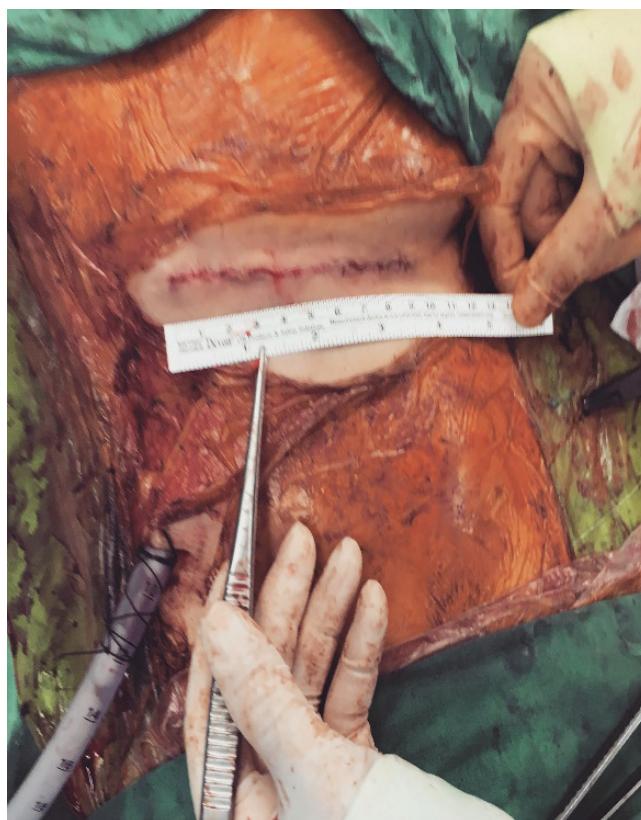
Figure 2. Post operative Mitral Valve Surgery

In the upper J-ministernotomy group for AVR, approximately 6–8 cm-long midline skin incision was made starting from the suprasternal notch. The sternum was divided down to the fourth intercostal space and angled right using an oscillating saw (J-shape). An inferior J- or T-shaped mini-sternotomy with 6–8cm skin incision was made in the CABG group. LIMA was harvested for all CABG patients. Cannulation was performed with conventional technique as ascending aorta and right atrial appendix for AVR and CABG patients. Additionally, for six patients, beating-heart CABG was performed with J-mini-sternotomy incisions.