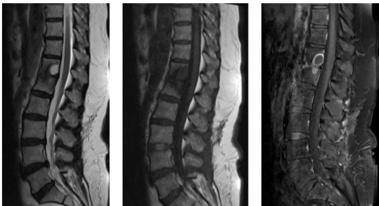
Figure 3. MR scanning at the end of five months

day. In addition, the patient was closely monitored with corset stabilization and mobilization restriction. No progression was detected in the control MRI performed two months later.